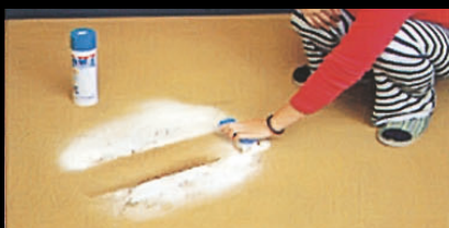
O4. Scrub with nylon brush