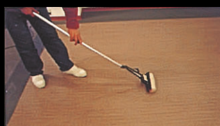
O9. Wipe with special mop