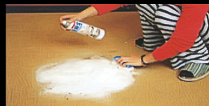
O3. Spray detergent on stains