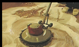
O3. Scrub and collect dust with roller brush machine