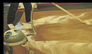
O4. Collect waste water with dry-wet vacuum cleaner