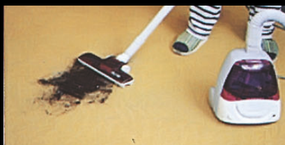
O2. Collect dust