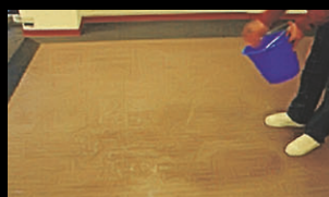
O2. Splash detergent foam in warm water