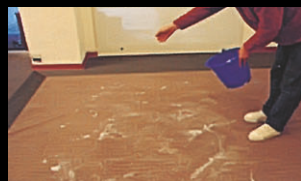
O7. Splash warm water for second cleaning