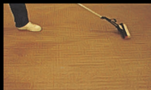
O6. Wipe with mop and warm water