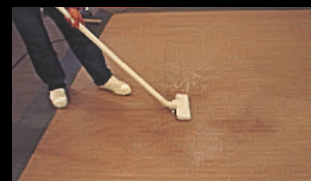
O8. Collect waste water with dry-wet vacuum cleaner