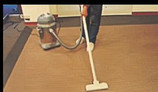
O1. Collect dust