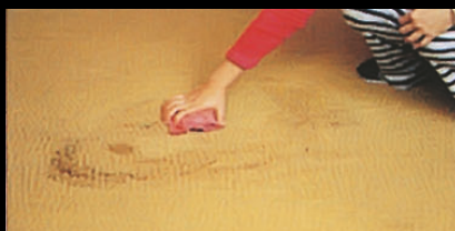
O5. Wipe with rags or mop