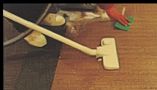
O5. Clean local stains with brush