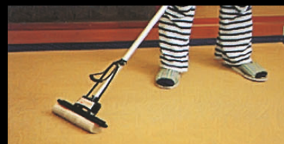
O6. Wipe with warm water